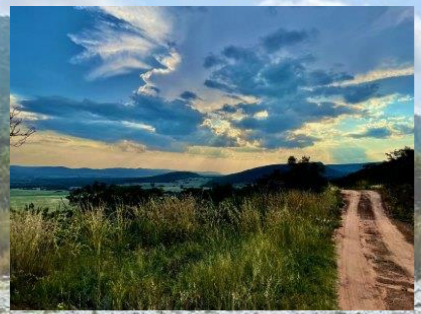
Thank you to the fellow Boschhoekers who have surpassed themselves as always with their astonishing pictures!

we invite you once again to come and share in our Serenity@Boschhoek. A lovely day outing from the city, we will take you exploring for a couple of hours' in our open game vehicle over weekends or as it suits to view the remaining properties. Kindly call to arrange. Combine it with your own streamside picnic, or enjoy a lovely light meal at <a href="Leeuwenhof Country Lodge and Garden Spa">Leeuwenhof Country Lodge and Garden Spa</a> next door.