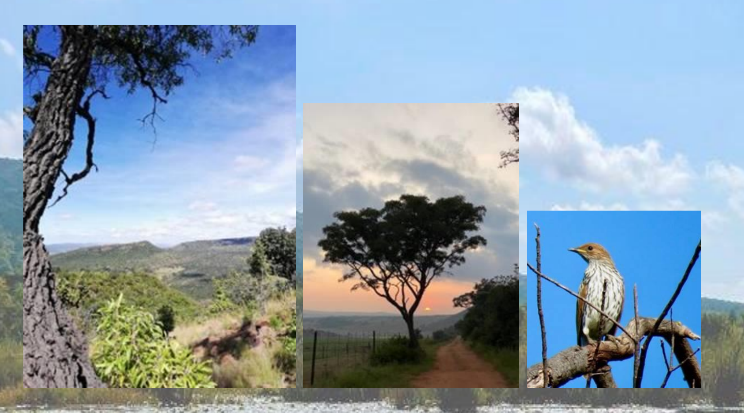
Those who prefer to share with like-minded others could also consider one of the last three shares in our Berg&Bosch shared lodge at R350 000.