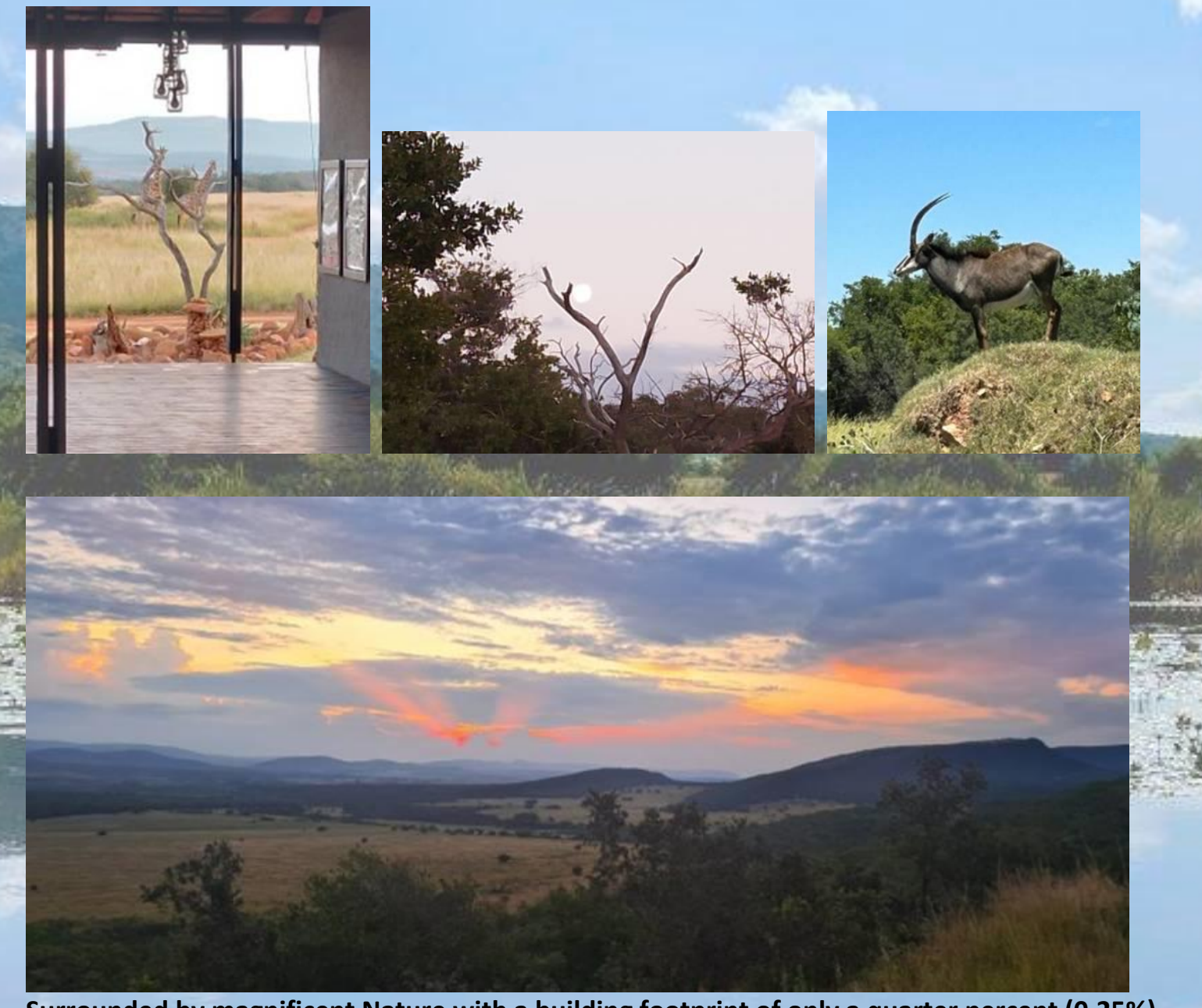
Surrounded by magnificent Nature with a building footprint of only a quarter percent (0.25%), Boschhoek lets us teach our children and their children what the world should be.

85% sold, with our <u>last phase</u> property prices from only R999 000 and with no minimum size for your bush home, Boschhoek lets you live your own bush dream, whether a soul searching retreat or a magnificent lodge. Whether for a weekend breakaway or a new life altogether, Boschhoek is our refuge of Serenity. With levies of only R1418 per month, ten years to start building and minimal holding costs, Boschhoek makes it possible.