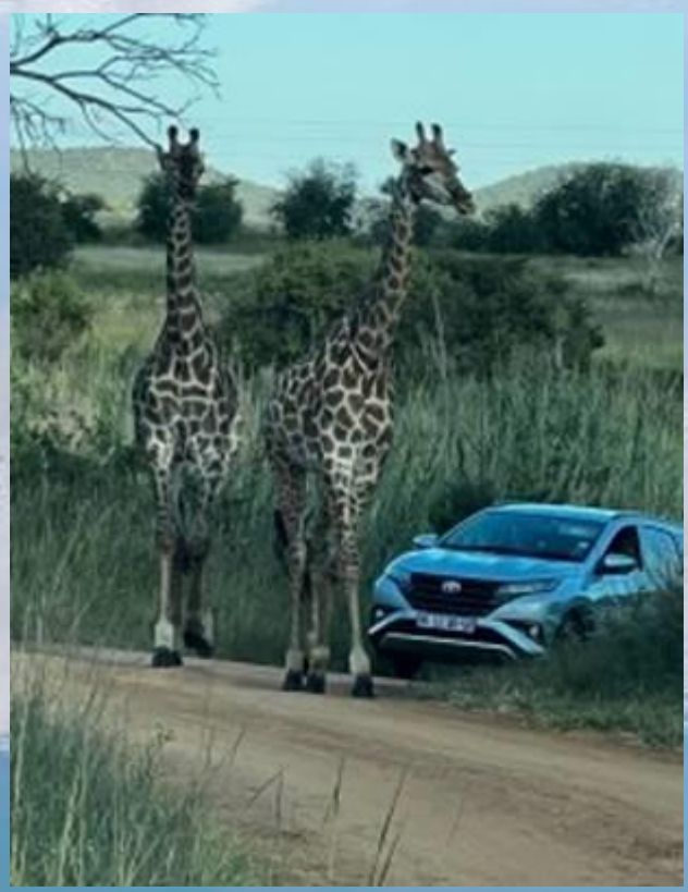
and where we are mere guests in awe of our hosts.