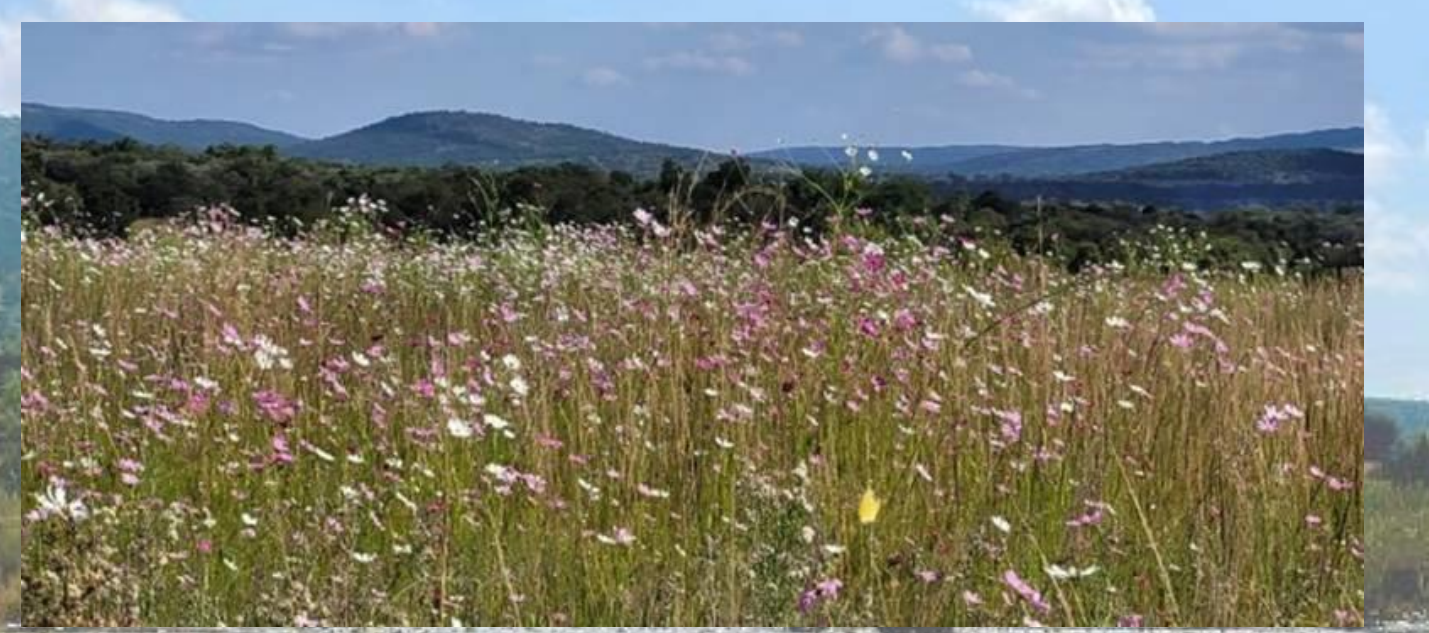
As the cosmos flowers herald another turn of the seasons at Nature's own graceful pace

See <u>here</u> for an exquisite two minute flyover and <u>here</u> for an article in SA's premier Estate Living magazine.