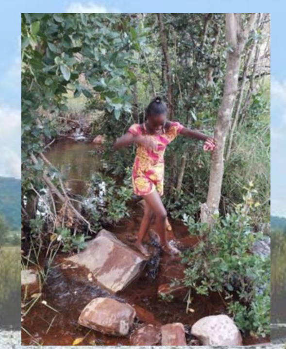
Come and join us at Boschhoek Mountain Estate.

Only an hour and a half from Pretoria and two hours from Johannesburg, with only a couple of full title 1-2 hectare properties left in our 1500 hectare sanctuary, Boschhoek has no equal.