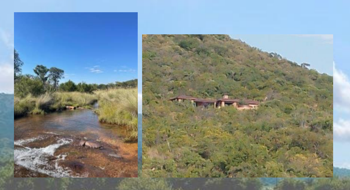
Where the brown hyena roams unperturbed at night and civet and porcupine go about their business,