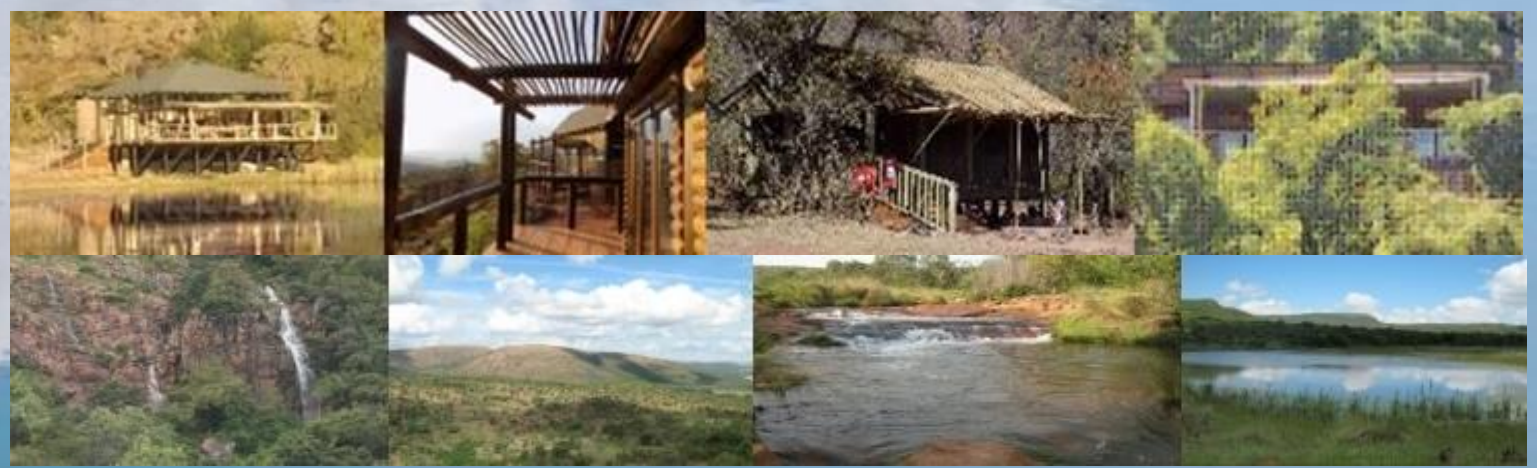
For a hauntingly beautiful two minute flyover, see <a href="https://youtu.be/cvpAIbnOH84">https://youtu.be/cvpAIbnOH84</a> For previous newsletters, see <a href="http://www.boschhoekmountain.co.za/Newsletter.html">https://www.boschhoekmountain.co.za/Newsletter.html</a>

No minimum size for your bush home, whether a rustic weekend getaway or a magnificent mountain lodge